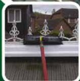
Conservatory Deep Cleans