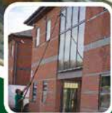
Safe, Efficient Ladder-Less Cleans