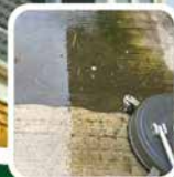
Refreshing, Driveway & Pathway Cleans